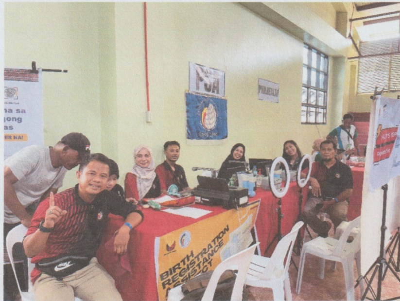
PhilSys and Brap Registration Team of PSA RSSO BARMM Tawi-Tawi

Date of Release: 29 October 2024 Reference No. TAWITAWI PR001-2024