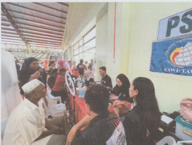
PhilSys Step 2 Biometric Capturing