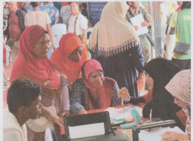
Birth Registration Assistance Project