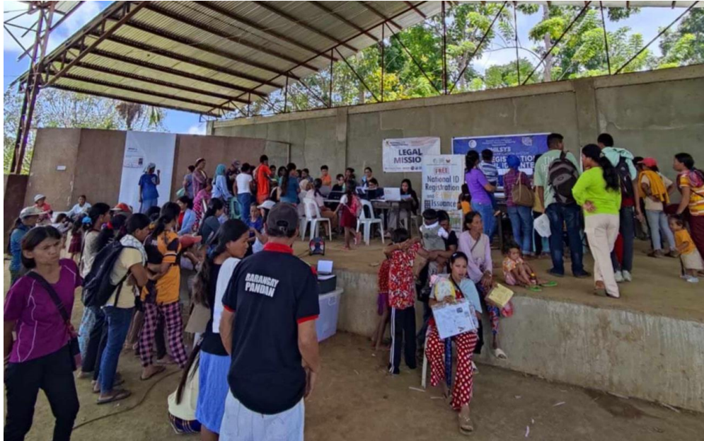
During the Registration Activity at Barangay San Jose, South Upi, Maguindanao Del Sur

South Upi, Maguindanao Del Sur – The Philippine Statistics Authority (PSA) Maguindanao PhilSys Team actively participated in the successful LEGAL MISSION event held in Barangay San Jose and Barangay Pandan, Municipality of South Upi, Maguindanao Del Sur on October 3-8, 2024. Organized in collaboration with the Initiatives for Dialogue and Empowerment through Alternative Legal Services (IDEALS), a non-profit organization dedicated to legal advocacy, the event aimed to provide critical legal and identification services to marginalized communities. During the event, the PSA PhilSys team offered essential services such as the Step-2 registration for the National ID, retrieval of Transaction Reference Numbers (TRN), and education on the use of the Digital National ID as a valid and sufficient proof of identity. These efforts are crucial in promoting the government's goal of creating a more inclusive identity system, which provides access to various public services and enhances legal and social protections. The mission placed special focus on the Indigenous Peoples community and other underrepresented groups in Maguindanao Del Norte who had yet to register for the National ID. By enabling these residents to obtain a National ID, the PSA Maguindanao team played a key role in supporting the inclusivity and security of the Philippine identification system, making it easier for vulnerable communities to access services and benefits.