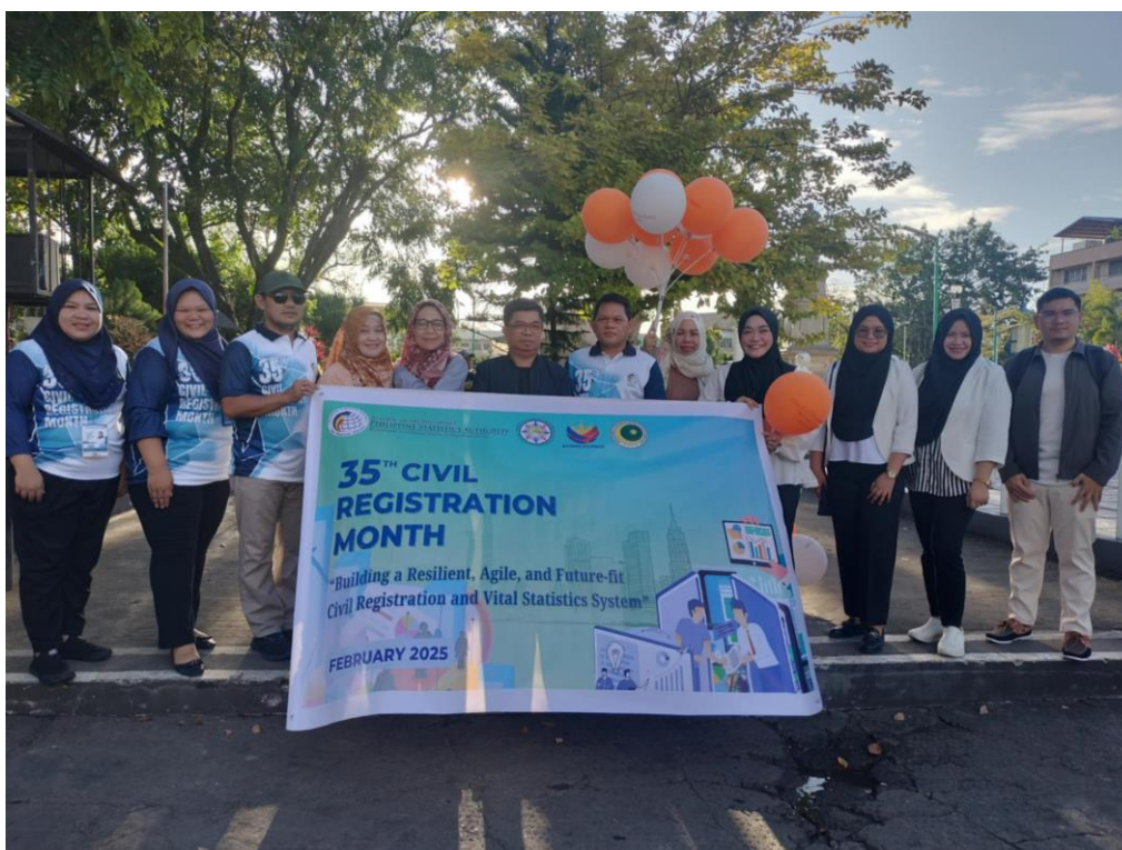
PSA BARMM Personnel together with Municipal Local Civil Registrar

03 February 2025, Parang, Maguindanao Del Norte – The Philippine Statistics Authority – Regional Statistical Services Office of the Bangsamoro Autonomous Region in Muslim Mindanao (PSA RSSO-BARMM), in collaboration with PSA Maguindanao and the Association of Local Civil Registrars of Maguindanao Del Sur, Maguindanao Del Norte, and Cotabato City, successfully launched the 35th Civil Registration Month with a grand kick-off program. This year's theme is: “Building a Resilient, Agile, and Future-Fit Civil Registration and Vital Statistics (CRVS) System.”