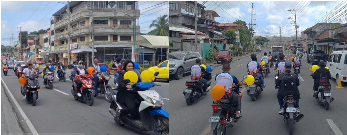
During the motorcade at Cotabato City National Highway

Date of Release: 02 October 2024 Reference No.: 38PR-2024-099