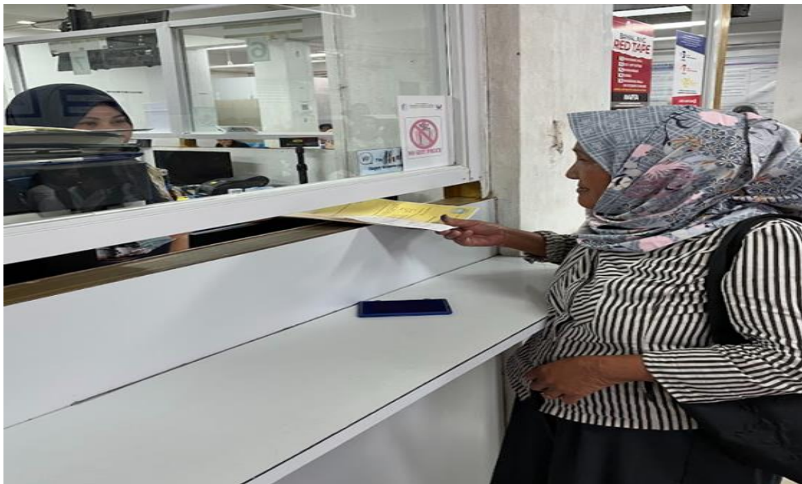
Action Photo of a CRS outlet personnel handing over the free copy of Security Paper (SECPA) to the client as part of the 35th Civil Registration Month celebration.