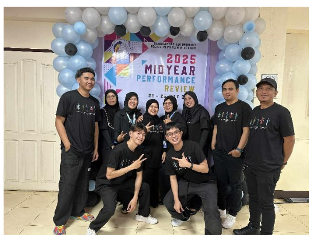
PSA-BARMM conducts its 2025 Mid-Year Performance Review, bringing together provincial offices for three days of reflection, planning, and realignment toward achieving statistical goals.

The 2025 PSA-BARMM Mid-Year Performance Review was held from July 22 to 24, 2025, with active participation from the five provinces of BARMM: Sulu, Tawi-Tawi, Maguindanao del Sur, Maguindanao del Norte, Lanao del Sur, and Basilan. The event was led by the PSA-BARMM Regional Office.